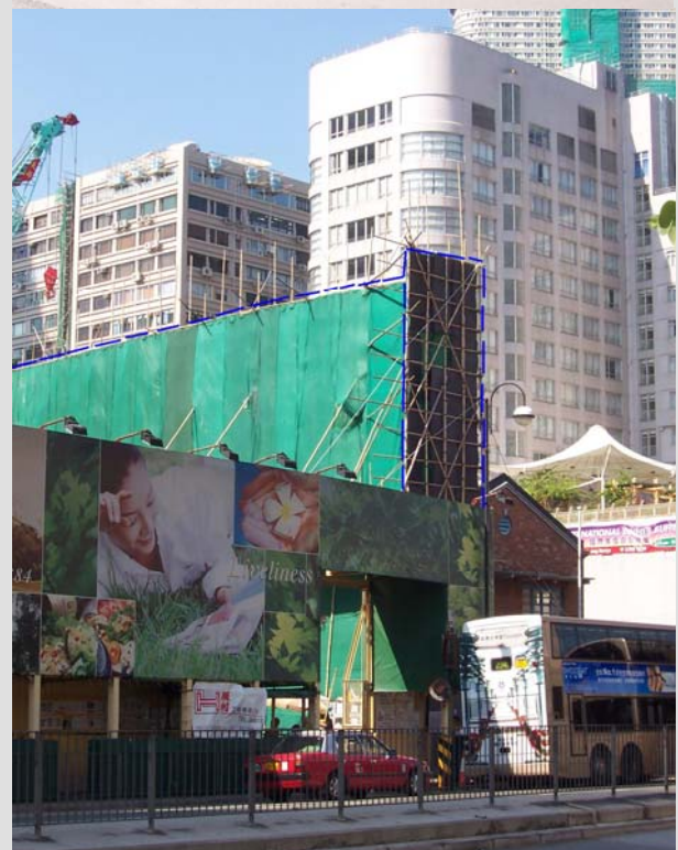
View from site to receiver