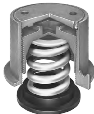
MASON FS Spring Jack-up Mount

Given the emerging trend of enhancing recreational facilities at working offices, we recently are awarded in two Gym Room projects at Two ifc and Chater House, with installation of "MASON" Spring Jack-up Floating Floor System. (See Project Facts in following pages)