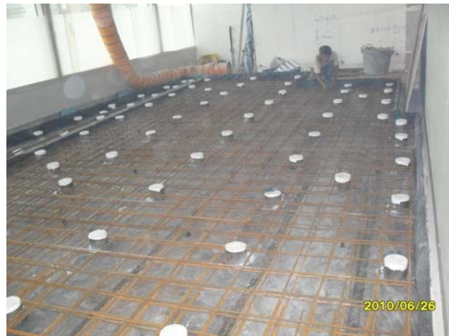
Installation of 60 nos. MASON FS4 isolators