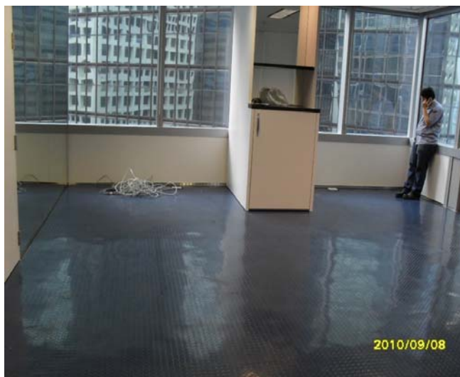
Acoustic treated floors for fitness facilities