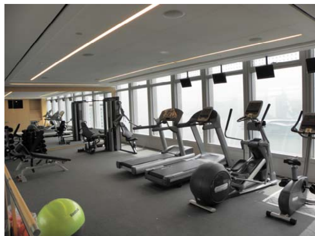
Equipments creating impact noise to floor below