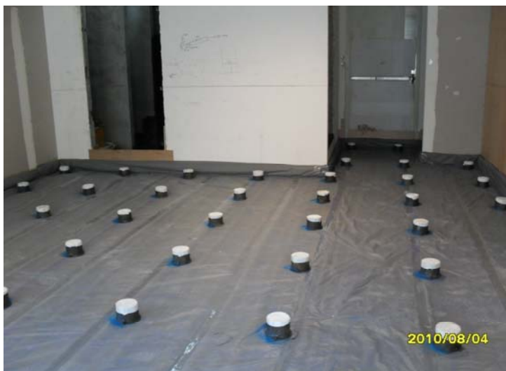
Installation of 60 nos. MASON FS4 Isolators

Floating Slab Thickness : 100mm ( 4” ) thick Reinforced Concrete Jack-up Spring Isolators : 50mm ( 2” ) Rated Static Deflection Mountings Air gap underneath slab : 50mm ( 2” ) Jack-up Isolator Model : Mason FS4-C2-880 Designed Natural Frequency : <1.5Hz